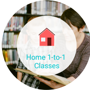
Home 1-to-1 Classes

Our home-based 1-to-1 classes bring the full classroom experience to your doorstep. Some children benefit from the added dimension and this mode of delivery caters to the individual requirements of our Young Explorers.