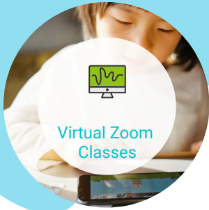
Virtual Zoom Classes

Our online Zoom classes offer compelling value and will keep your child engaged with our creative and enchanting theme-based learning environments. With our small class sizes, early literacy has never been made this easy and fun.